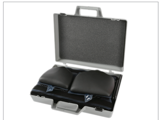
Dedicated case for convenient handling and storage across diverse clinical environments, including MR environments

RT-4558CB02 ZiFix Abdominal/Thoracic Motion Control System