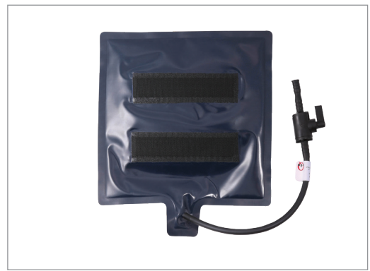
Bladder is designed to be durable up to 250 mmHg, a 2x factor of safety