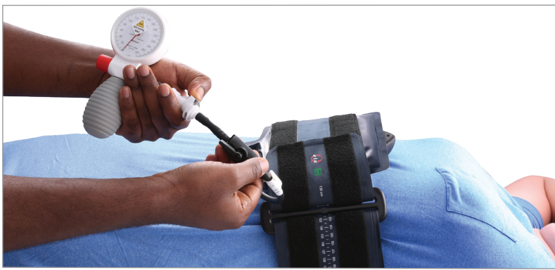
Shutoff valve and quick disconnect pump provide secure method of sealing air inside the bladder to enable consistent pressure