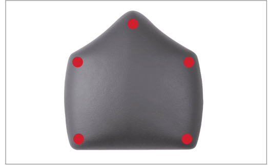
Fiducial markers aid in consistent patient setup relative to patient anatomy